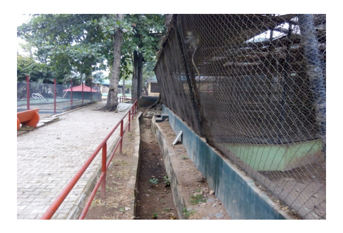
Plate 2: Distance of about 4ft between the Monkeys' enclosure and the visitors, University of Ibadan Zoo.

Furthermore, some of the tourists (18; 14.0%) opined that tourists should be careful with the animals, as they can be carriers of the Ebola virus (EV). This had been well emphasized in ECDPC, (2014b) that visitors and residents in EVD-affected areas face a low risk of becoming infected in the community if the following precautions are strictly followed.