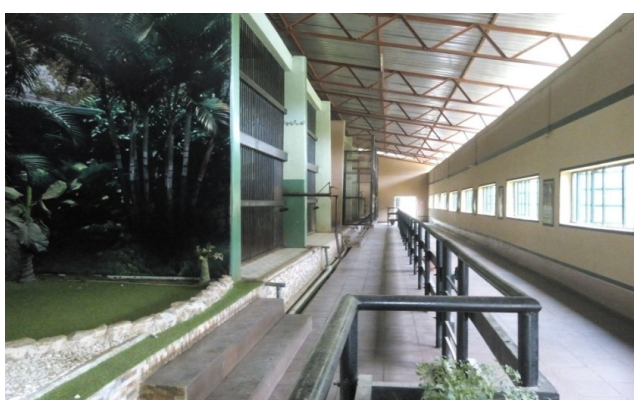
Plate 1: Distance of about 5ft between the Ape house and visitors, University of Ibadan Zoo